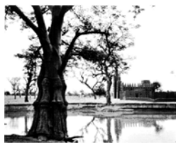
"Baobab Tree" is one of the many images displayed in the Africa in Mind photo exhibit.

On display in the Virginia Lacy Jones Exhibition Hall through May 13, is the exhibit, Africa in Mind . This collection of