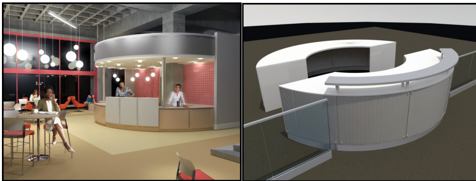
Café and Study Area (left) and Security Desk and Entry Area (right) in renovated Woodruff Library. (Images are not representative of final design.)

The renovation of the Robert W. Woodruff Library of the Atlanta University Center has begun and signs of the construction are visible all around the Library!