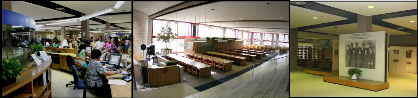
Circulation Services Desk