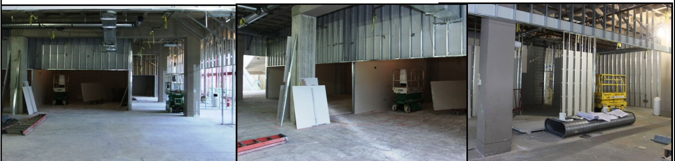
Information & Research Services Area