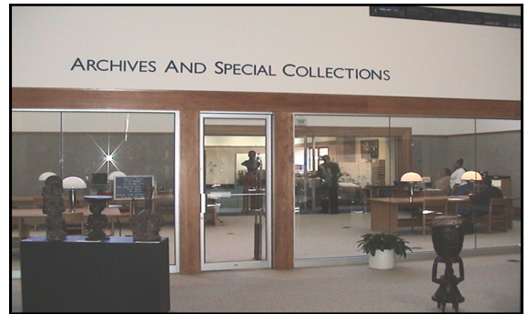
Throughout the fall semester, you Library's Archives and Special Collections Reading Room will undergo renovation. Reading Room research and reference services will be conducted in an Upper Level conference room.

Please contact Archives & Special Collections staff archives@auctr.edu or